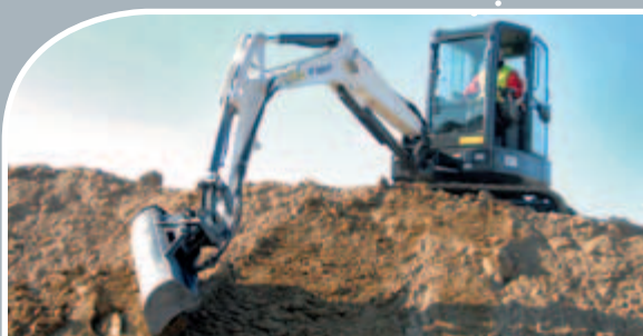
The tilt bucket is proportionally controlled by the joystick thumb switch with high precision thanks to the selectable auxiliary hydraulic flow.