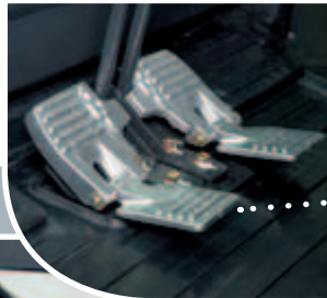
New ergonomic and foldable travel pedals improve cab comfort.