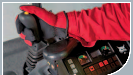
Third joystick controls blade flotation and auto-shift travel motors activation, for a more comfortable work environment.