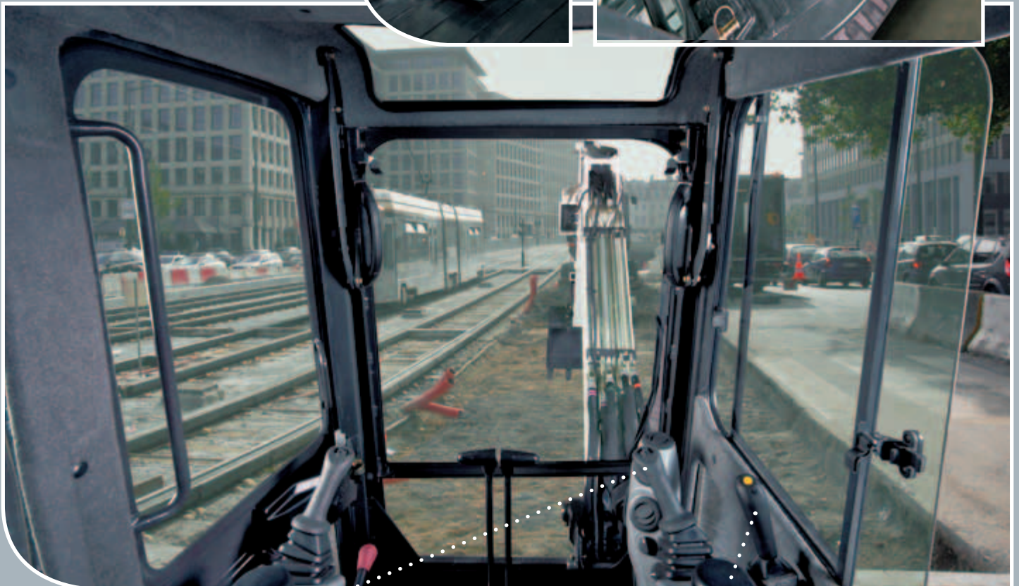
Great visibility, for a safer, stress-free ride.